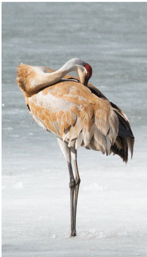
ABOVE: The mysterious world of grassland bird nesting will be revealed in Into the Nest this summer. LEFT: Does this sandhill crane have cold feet?