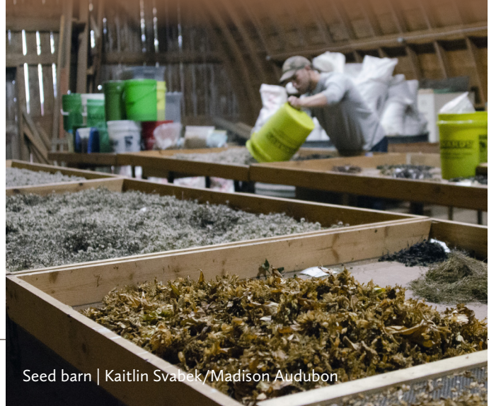
Seed barn

More info: madisonaudubon.org/seed-collecting