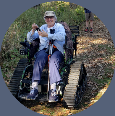
Field trip participant using an Access Ability Wisconsin outdoor wheelchair on a Madison Audubon outing.