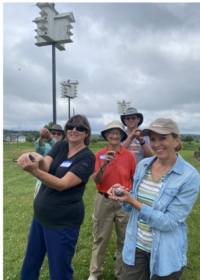
ABOVE: Purple Martin party. RIGHT INSET: A nestling in a cavity