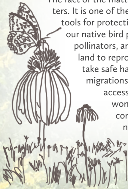
Benade addition at time of purchase, photo by Judi Benade | illustration by Kaitlin Svabek/Madison Audubon

The fact of the matter is that land matters. It is one of the best conservation tools for protecting and bolstering our native bird populations. Birds, pollinators, and other wildlife need land to reproduce, find food, and take safe harbor on their long migrations. People, too, need access to land and all the wonderful benefits that come with being in nature. The more birds that use the land and the more people who visit those lands, the better.