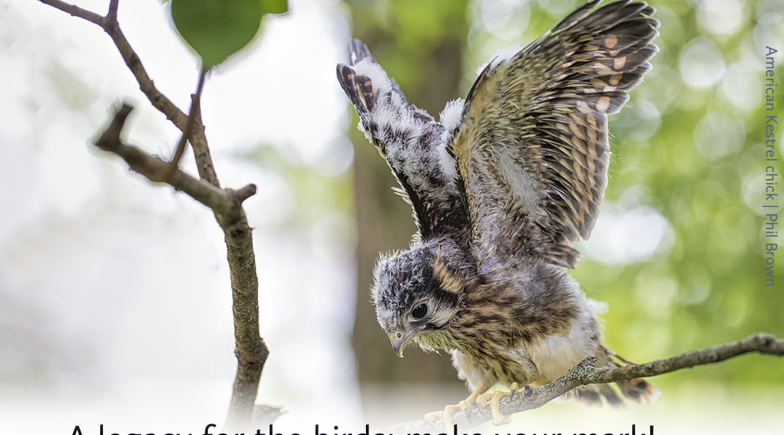
American Kestrel chick