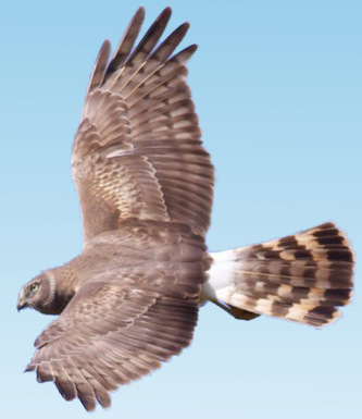
Northern Harrier | Arlene Koziol

Madison Audubon's land management model may not be the least expensive around, but it's one of the best. After all, our native wildlife deserves our best efforts.