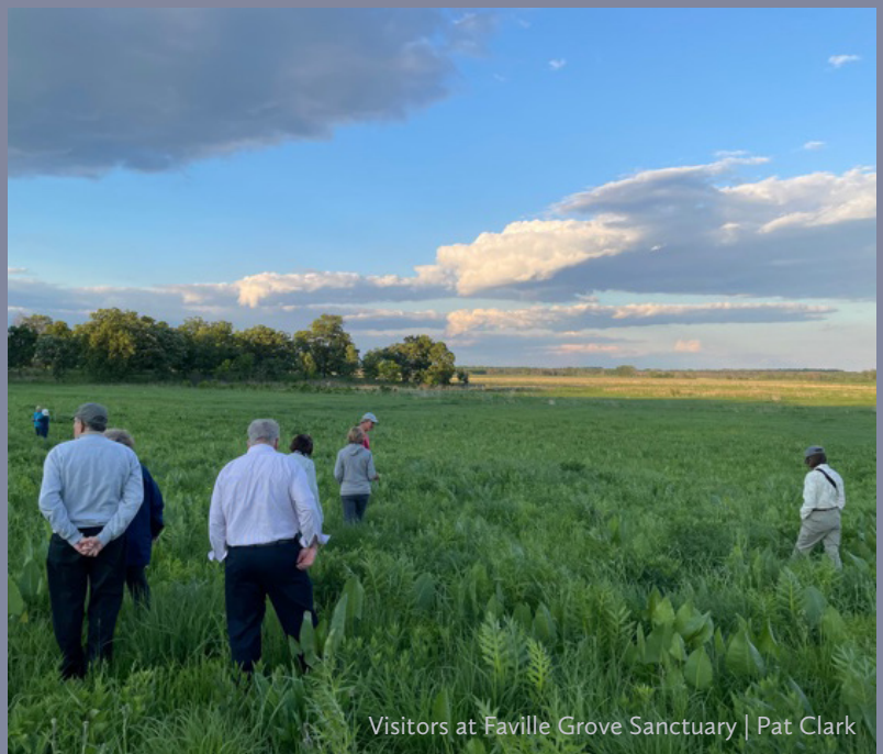
Visitors at Faville Grove Sanctuary | Pat Clark

Visit the places you helped save and see their value for yourself. Find maps and more at madisonaudubon.org/land