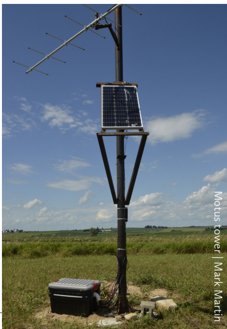
Motus tower