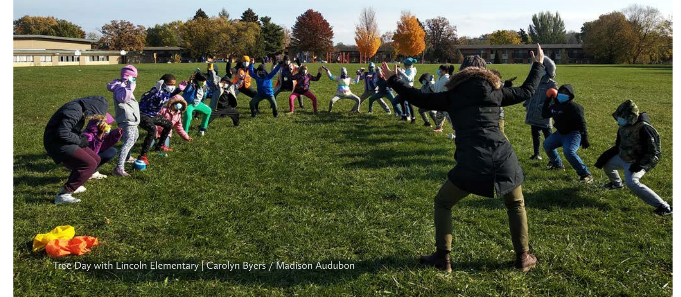
Tree Day with Lincoln Elementary