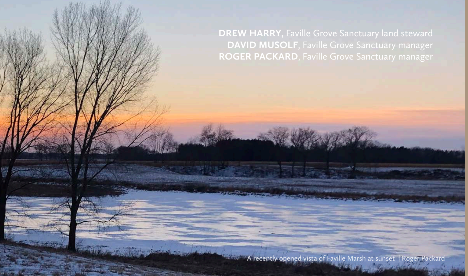
A recently opened vista of Faville Marsh at sunset