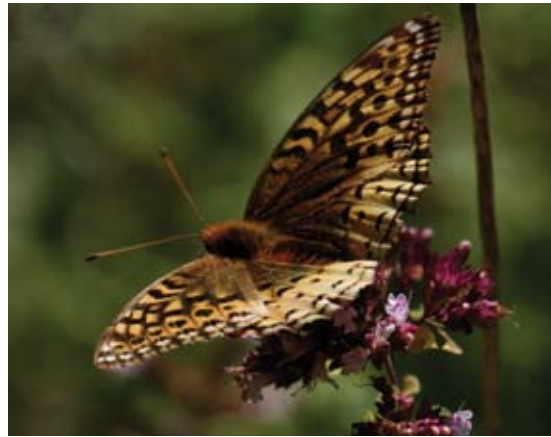
Great Spangled Fritillary

4. Ankenbrandt Prairie –Visitors can walk north on the mowed old farm lane from Kampen Road to Highways 51 and 60. This large, productive restoration features over 50 plant species on 80 acres. Park in mowed area at southwest corner of the prairie.