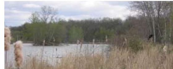
Otsego Marsh-early Spring