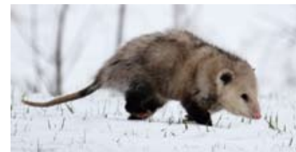
Opossum on warm winter day

Please stay on established trails, and remember that wildlife sanctuaries are places where wildlife needs to feel safe. Dogs are not permitted.