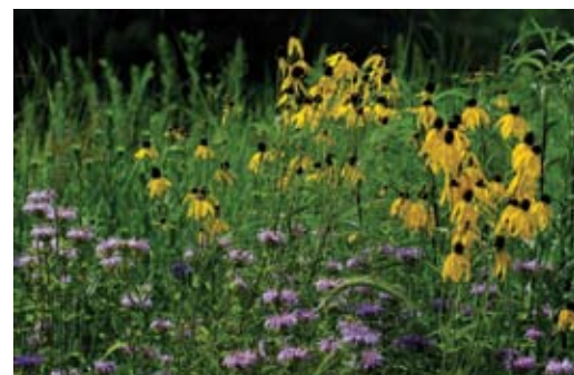
Prairie in mid-summer bloom

Madison Audubon Society 222 S. Hamilton St. - Suite #1 Madison, WI 53703 608-255-BIRD (2473) masoffice@mailbag.com www.madisonaudubon.org