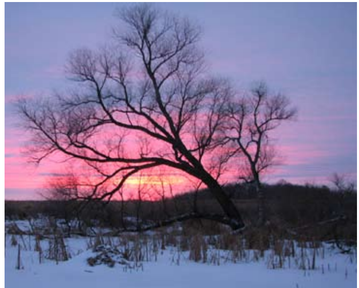
Sunrise at Faville Grove Sanctuary.

William Damm's wildlife camera captured this buck that we call "Spike" entering a food plot west of Goose Pond in November. This was the only time this buck was seen this fall. Spike bucks are uncommon in most years but the deep snow last year affected antler development due to lack of food.