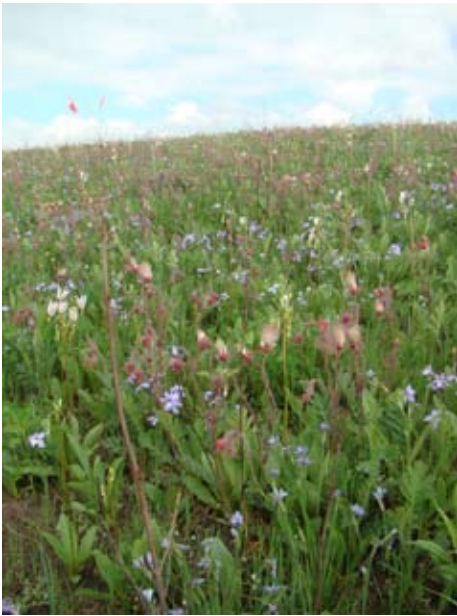
Hagen Prairie in May (blue-eyed grass, shooting star, prairie smoke) – near view.