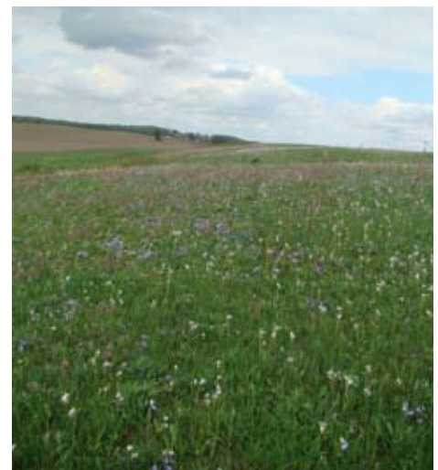
Hagen Prairie in May (blue-eyed grass, shooting star, prairie smoke) – long view.

Species planted in large amounts included lead plant, rattlesnake master, alum