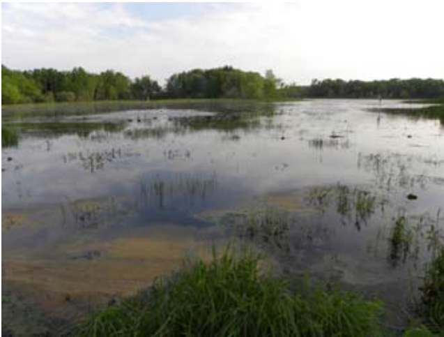
An unnamed shallow lake. Grassy Lake is in back of the woods.