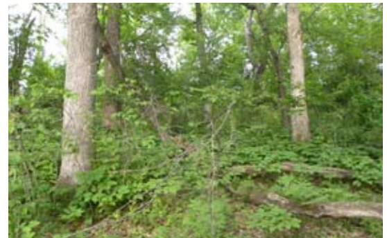
Brambles woodlot with large open grown white oaks

The Briggs property contains wetland, prairie, old field, oak savanna, and oak woodland habitat. It also contains 35 acres of wetlands including part of Grassy Lake, part of an unnamed shallow seepage lake, a sedge meadow, and an ephemeral