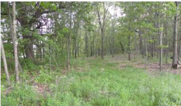
Oak savanna/oak woodland being restored by prescribed burning

pond. Gerry and Jeanne are restoring the property with prescribed burning and removing invasive species such as