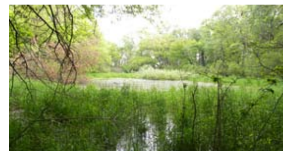
Ephemeral pond surrounded by oak woodland habitat