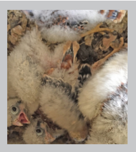
Kestrel chicks about 2 weeks old. Developing true feathers to replace downy feathers.