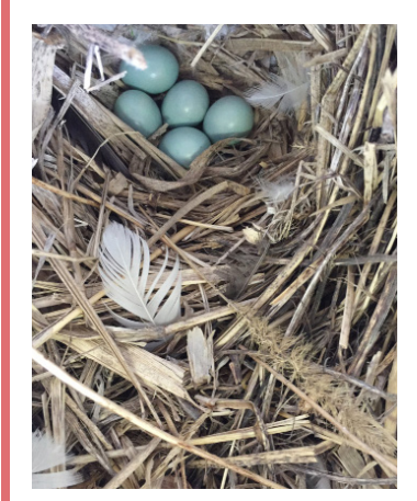
European Starling. Nest is made of rough grasses & feathers. Eggs are larger than robins.