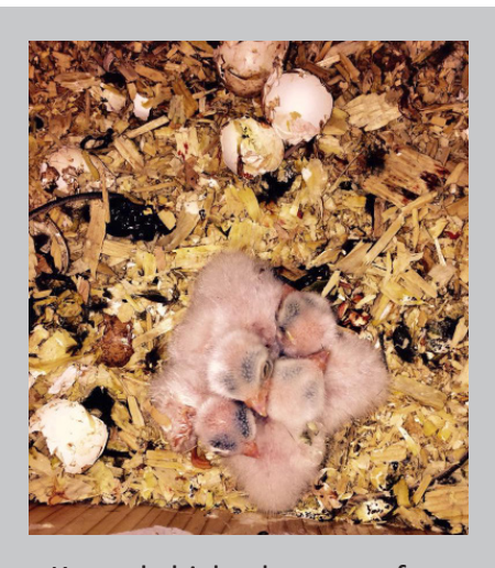
Kestrel chicks that are a few days old. Huddled together to stay warm & feel safe.