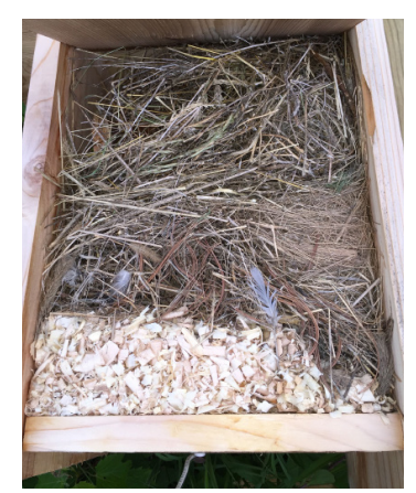
House Sparrow. Nest is made of rough grasses, feathers, & debris that fill the box. Eggs are grey with speckles. Remove nest!