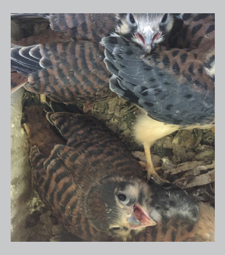
Kestrel chicks about to fledge. All brown = females, Blue-grey wings = males. Do not disturb!