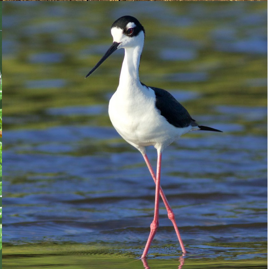
TOP: Dedicated volunteers braved the December cold to plant a new Goose Pond prairie. Madison Audubon photo | 2nd ROW LEFT: A common raven had never been recorded during the Poynette CBC—until now! Photo by Mick Thompson | MIDDLE: Masses of monarchs made September special. Photo by Arlene Koziol | RIGHT: Were you lucky enough to be one of the visitors to Goose Pond to catch a glimpse of a black-necked stilt? Photo by Arlene Koziol

Even after living and working at Goose Pond for many years, we can safely say no single year—let alone decade—is the same. The past year was one for records and milestones, and these pages include some of the highlights. We look forward to working toward our goals for the future with you and seeing how Goose Pond will change in wonderful, unexpected ways as well. Cheers to a new decade of conservation and celebration!